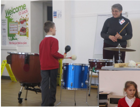
Years 3 & Year 4 enjoying music lessons