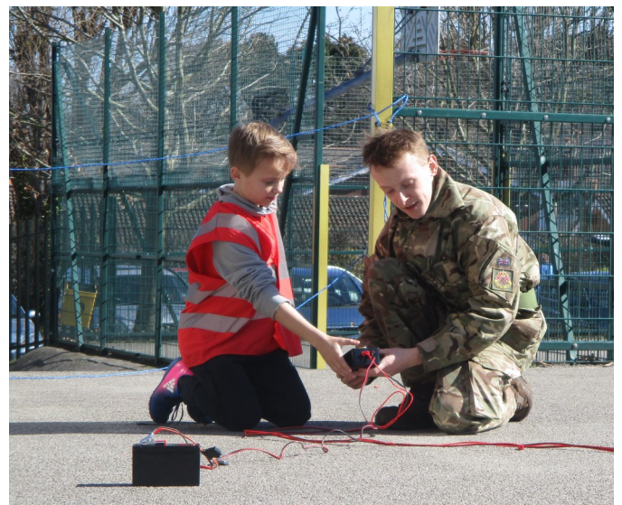
Year 6 children taking part in Rocket Car Racing at Calday—Can you spot ‘The Sand- brick’?