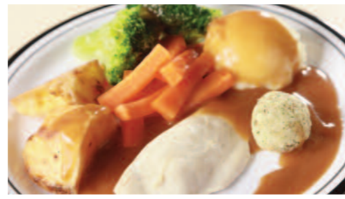
Roast Chicken served with Roast/Mashed Potatoes, Seasonal Vegetables & Gravy