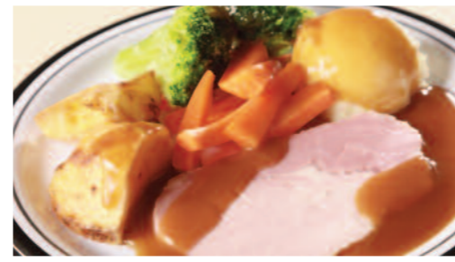
Honey Roast Gammon served with Roast/Mashed Potatoes, Seasonal Vegetables & Gravy