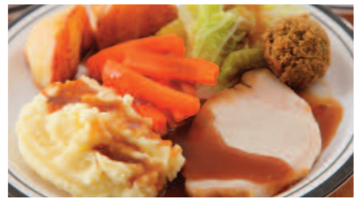
Roast Pork served with Roast/Mashed Potatoes, Seasonal Vegetables & Gravy