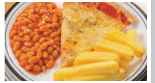
Cheese & Tomato Pizza served with Chips & Peas or Baked Beans

VEGETARIAN VERSIONS OF THE ABOVE MEAL AVAILABLE DAILY