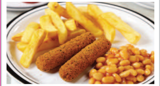
Breaded Mozzarella Sticks served with Chips & Peas or Baked Beans

VEGETARIAN VERSIONS OF THE ABOVE MEAL AVAILABLE DAILY