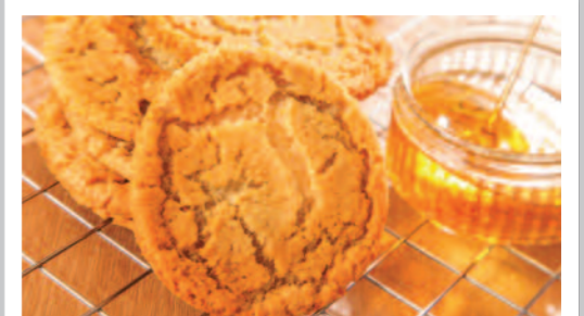
Golden Crunch Cookie

AVAILABLE DAILY – UNLIMITED SALAD, FRESHLY BAKED BREAD, FRUIT YOGHURT, FRESH FRUIT PLATTER & CHILLED WATER. FOR ALLERGEN INFORMATION, PLEASE ASK ONE OF OUR CATERING TEAM. ALL THE ABOVE DISHES ARE SUBJECT TO AVAILABILITY.