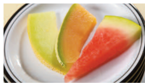
Trio of Melon