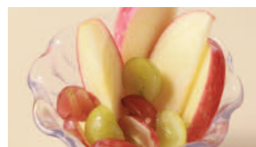
Apple & Grape Pot