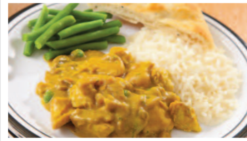
Chinese Chicken Curry served with Rice, Naan Bread & Seasonal Vegetables