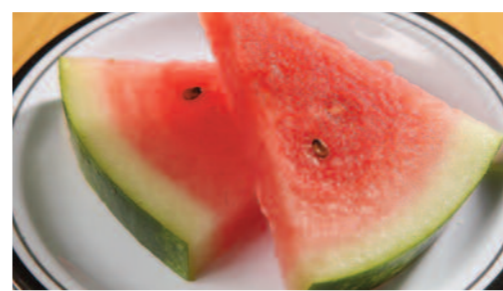
Fresh Water Melon Wedge