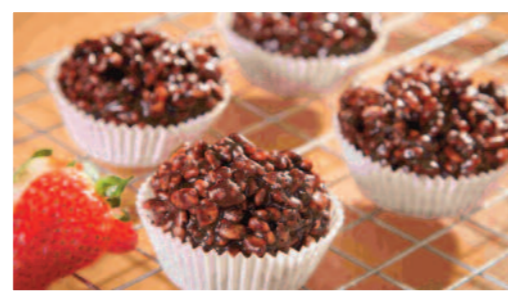
Chocolate Crispy Cake