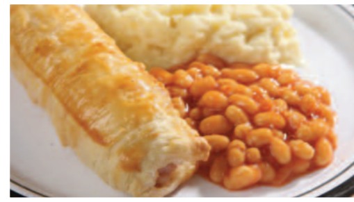
Homemade Sausage Roll served with Mashed Potato & Baked Beans