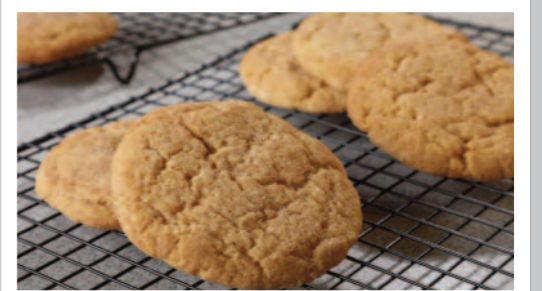
Snicker Doodle Biscuit

AVAILABLE DAILY – UNLIMITED SALAD, FRESHLY BAKED BREAD, FRUIT YOGHURT, FRESH FRUIT PLATTER & CHILLED WATER. FOR ALLERGEN INFORMATION, PLEASE ASK ONE OF OUR CATERING TEAM. ALL THE ABOVE DISHES ARE SUBJECT TO AVAILABILITY.