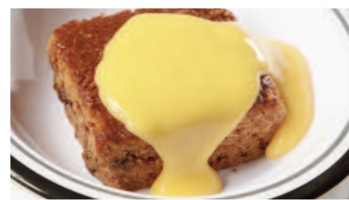
Sticky Toffee Pudding served with Custard