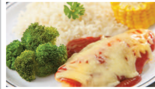
BBQ Chicken served with Savoury Rice and Seasonal Vegetables