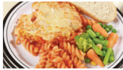
3 Cheese & Tomato Pasta served with Garlic & Herb Bread and Seasonal Vegetables