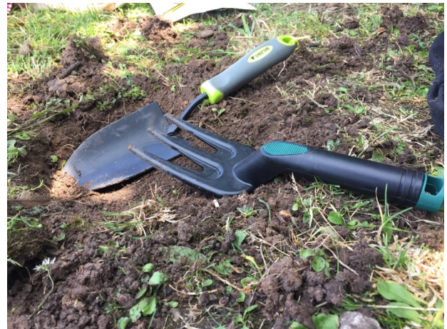
Y4 did an invertebrate survey in NSGW