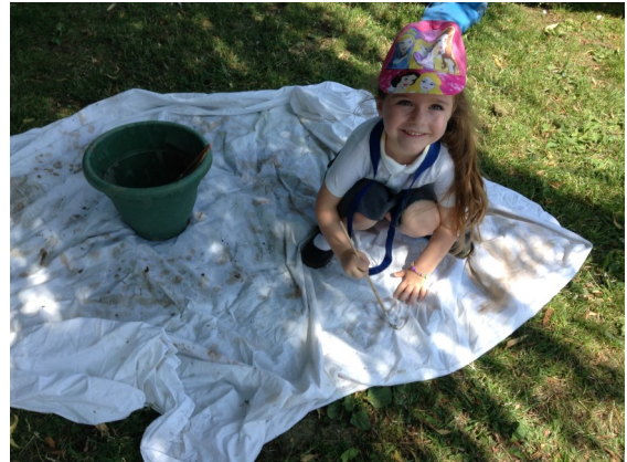
F2 mud painting in National Schools Grounds Week