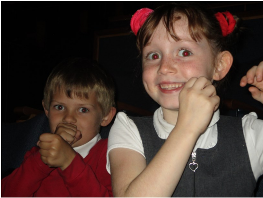
Y1/2 visit the Liverpool Philharmonic

We have 50 followers and would love all families to follow us so that we can share some of the wonderful things that your children say and do.