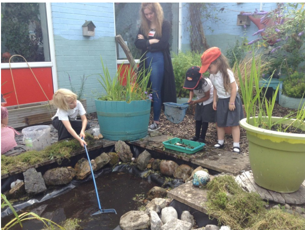
F2 pond dipping in NSGW